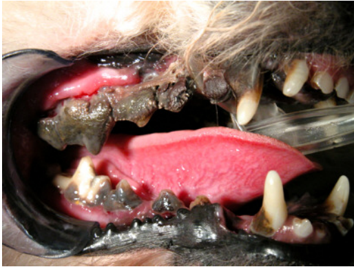
Un-brushed teeth in advanced decay and infection

(Permission was granted by Jan Bellows, DVM to reprint this article)