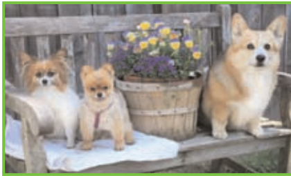
The Fournier Belles – Bella, Breezey, & Annie

appetite improved, she gained weight. I learned about supplements that could help support and cleanse her liver. Again, she improved. She got supplements and meds for her tummy. Her bloodwork test results came back in the normal range. Oh, the liver dysfunction is there, it always will be.