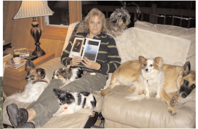
Everyone relaxing at home.

longer needed, and from then on I have been working with PapHaven.