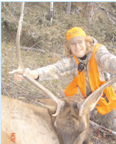
The Great Hunter!