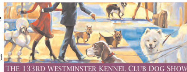
THE 133RD WESTMINSTER KENNEL CLUB DOG SHOW

Each group of 5 breeds are $10, 10 breeds are $20, or 15 breeds for $25.